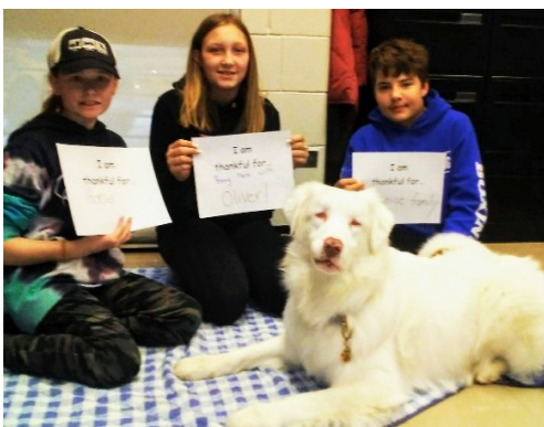
Oliver with students during a lesson.